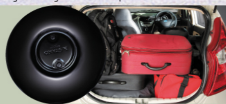
Tank capacity (water filling) - 34 litres

The company fitted Toroidal LPG tank is specially designed and is smartly located so that it does not use up much of the useful boot space.