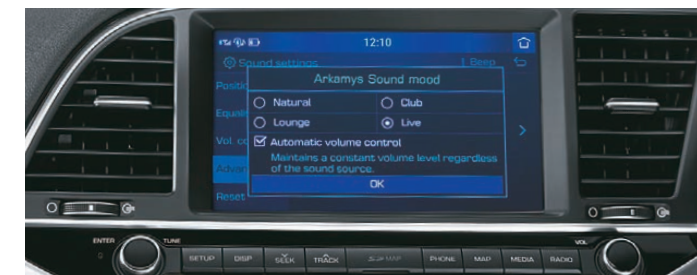
Arkamys Sound Mood

8.0 HD Touch Screen Multimedia System | 4 + 2 Speaker System