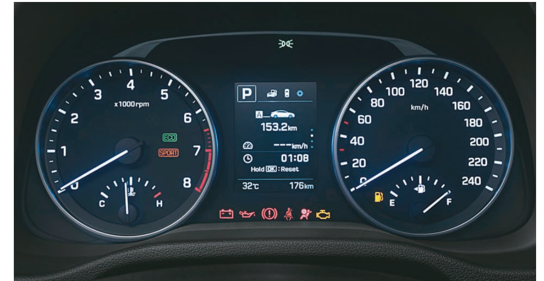
Advanced Supervision Cluster with Large 3.5 mono TFT Screen

Discover a world of affluence with the all new Elantra. Get overwhelmed with its plush interiors and arrive in style wherever you go.