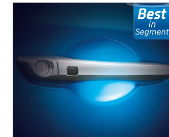
Chrome Door Handle with Pocket Light