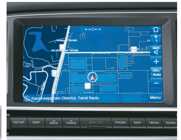
8.0 Smart Audio Video Navigation with Voice Command