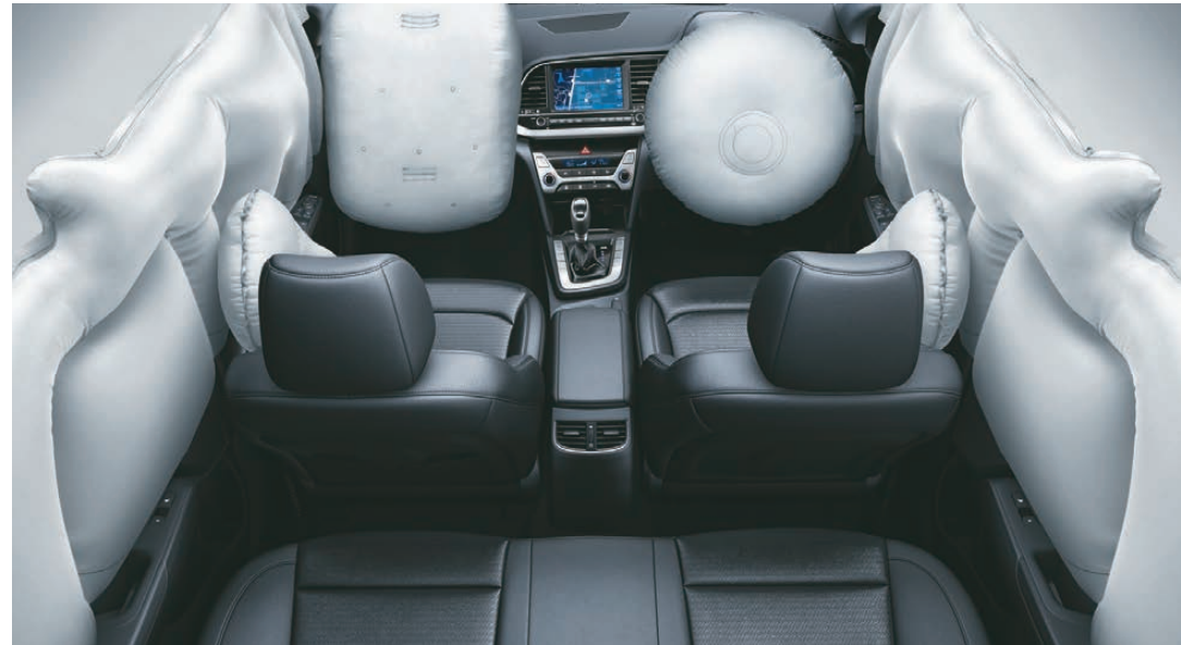
Six Airbags (Driver, Passenger, Side & Curtain)

The all new Elantra is designed with a top-of-the-line active and passive safety features that ensure complete passenger safety in all conditions.