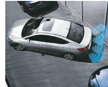
Rear Camera with 4 Parking Sensors