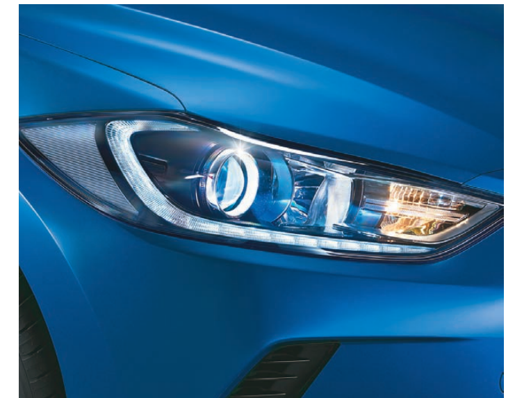
HID Headlamps with LED DRL