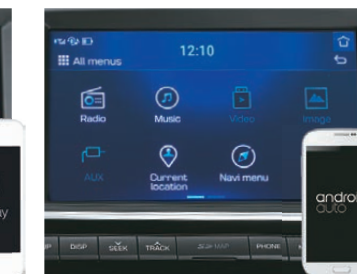
Android Auto Connectivity