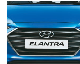
3 Dimensional Radiator Grille