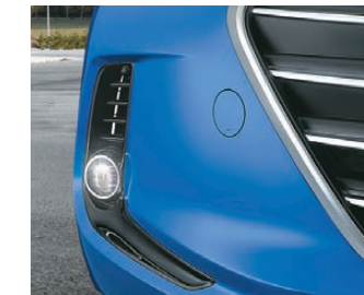
Projector Fog Lamp