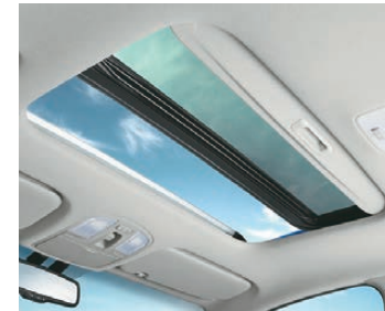
Smart Electric Sunroof