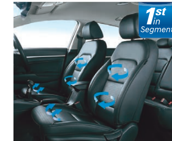
Front Seat Ventilation System