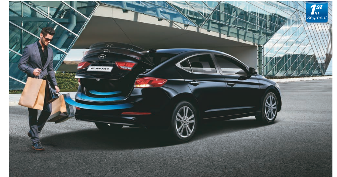
Hands Free Smart Trunk

Discover innovation like never before. The all new Elantra comes with class-leading features, thoughtfully crafted to offer an effortless driving experience.