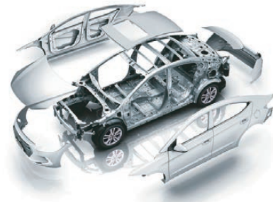
Strong Structure with 53% Advanced High Strength Steel