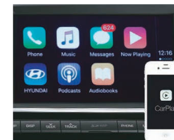
Apple CarPlay Connectivity