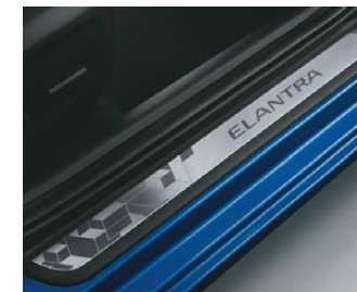
Premium Aluminium Scuff Plates